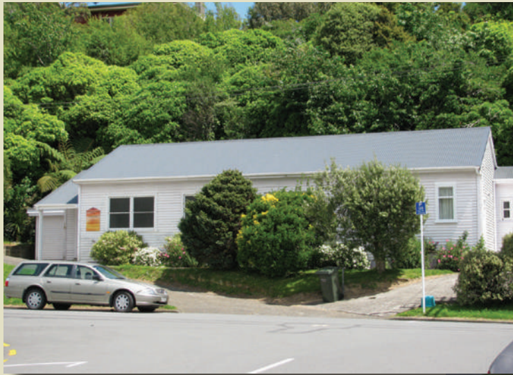
Rewa Street, Tawa