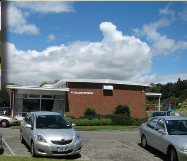
Linden Community Centre

In 1969 the club moved to the Linden Community Centre.