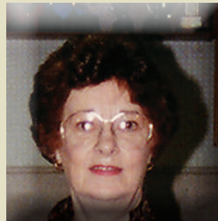
Eileen Gray 1982