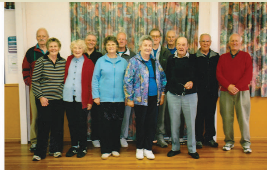
Above Back row from left: