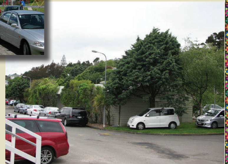
Red Hackle Pipe Band Hall

There was no statement of case either for or against the admission of men however there was some ongoing concern about declining membership and the likelihood of increased rental expenditure if/when the club moved to new premises.