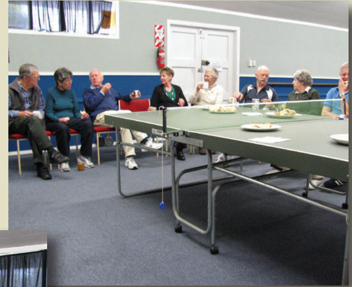
Right: Cuppa and chow. Bottom right: Look who else got the Chocolate Fish.